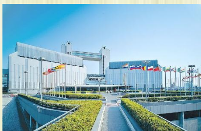
Nagoya Congress Center