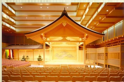
Nagoya Noh Theater

Nagoya Noh Theater, Nagoya, Japan. https://www.bunka758.or.jp/scd24_top.html